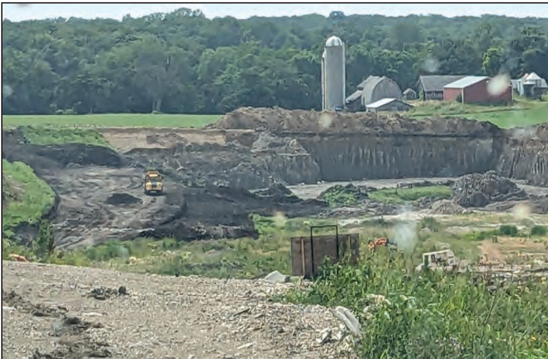
Borrow area active generating cover for capft