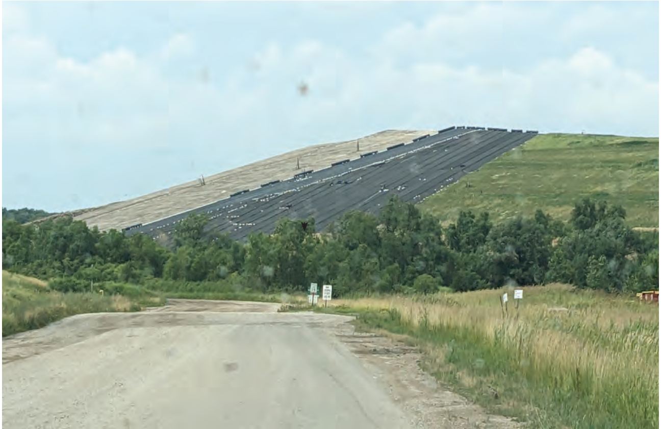
Clay cap nearly complete, when finished top soil will be placed