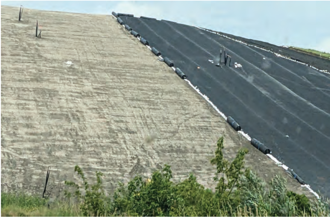
West slope of Phase 3, cap construction