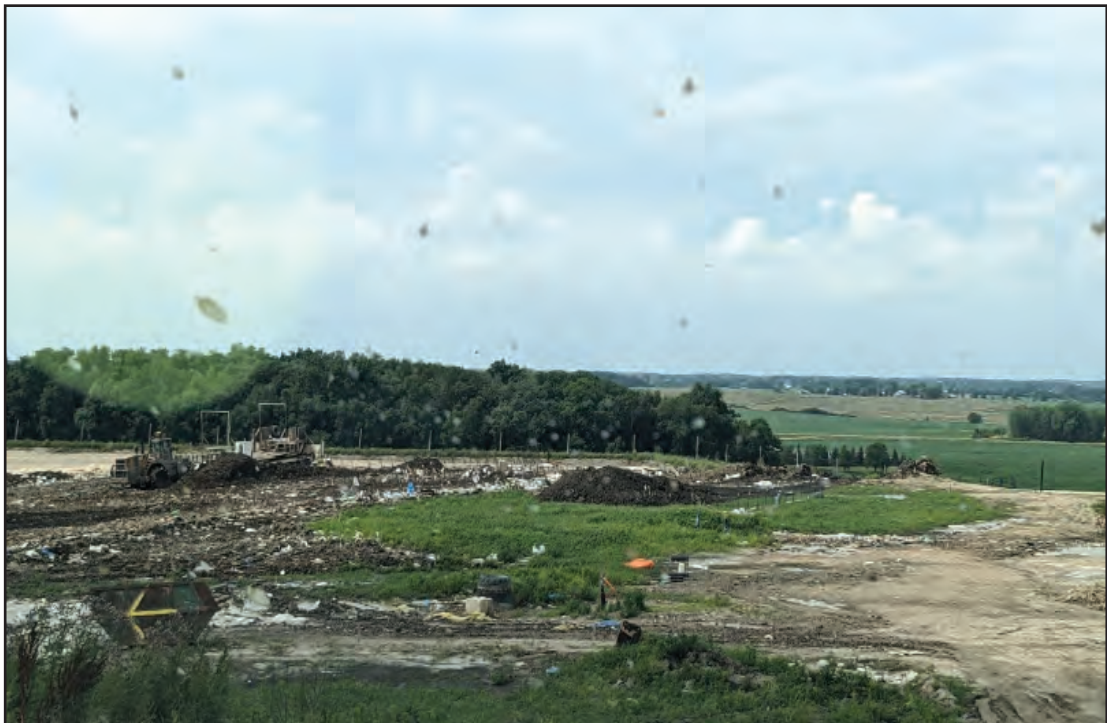
Litter picked back from site edges