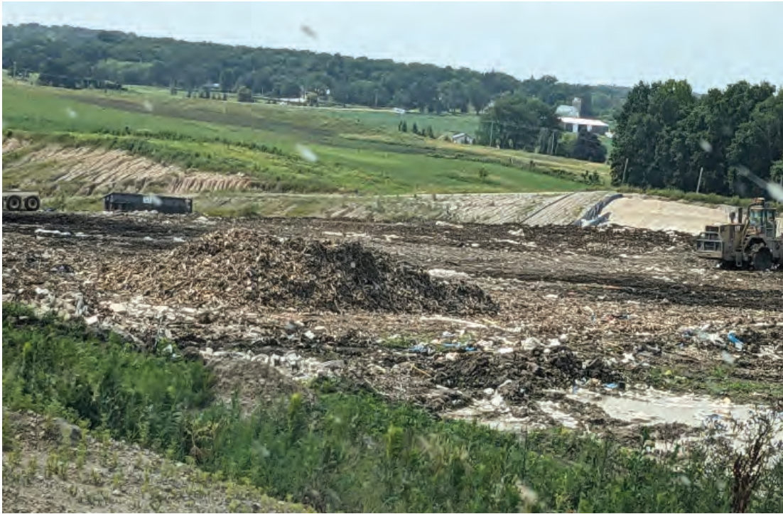
Working face covered for the day