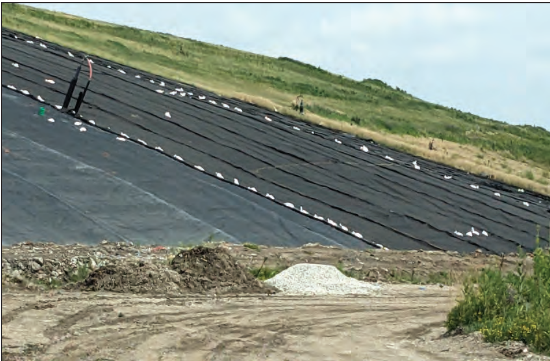
Geocomposite placement over solid plastic