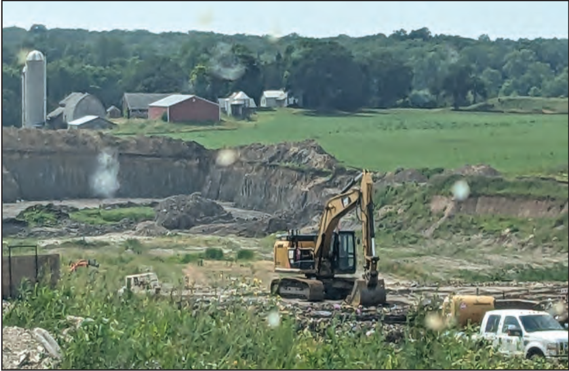
Borrow area after cap excavations