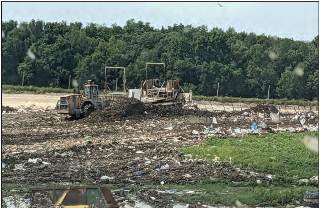
Tipper awaiting truck