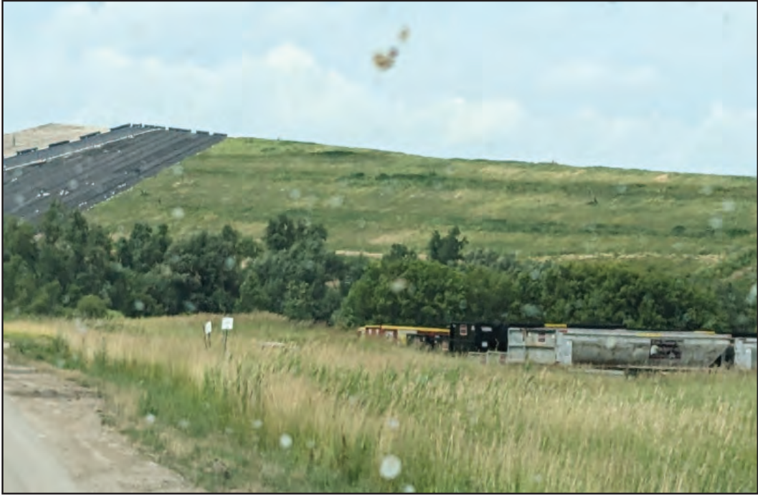
Clay cap complete, plastic being applied