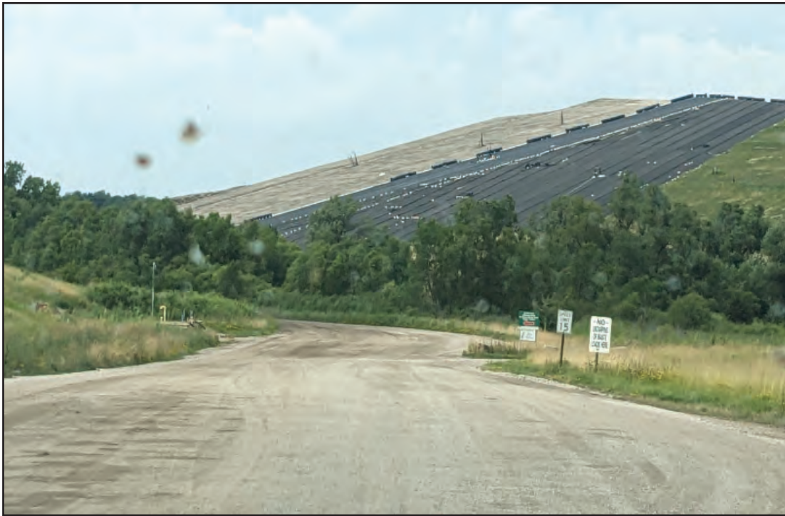
Cap cover in transission